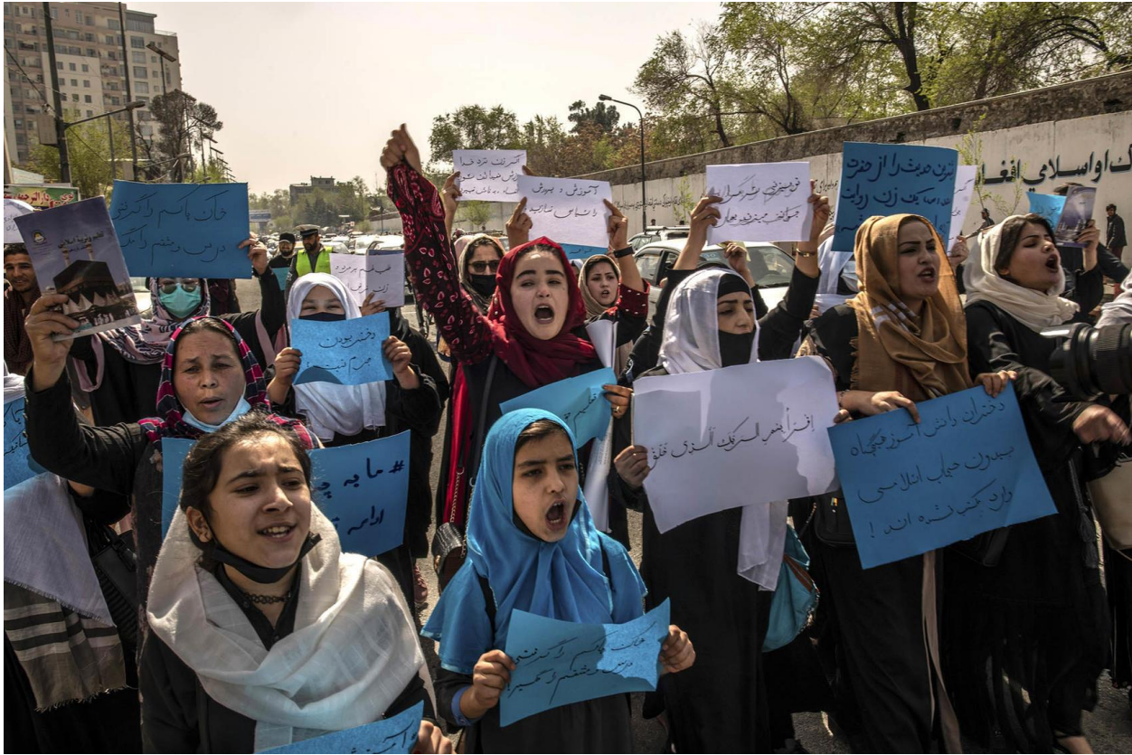
Women protest the Taliban's decision to cancel the return of high school-aged girls to the classroom, in Kabul, Afghanistan, on March 26, 2022.

By the conclusion of 2021, the first four months of the Taliban's rule indicated a continuity in their treatment of women, resembling their approach from the 1990s 17 . Various measures, including a mandated dress code, the need for a chaperone (mahram) in public, and a prohibition on women and girls in public parks, increasingly restrict their access to public spaces. In August 2022, reports emerged of 60 women university students being barred from leaving Afghanistan as they lacked a mahram, prompting many women to avoid solo travel. 18