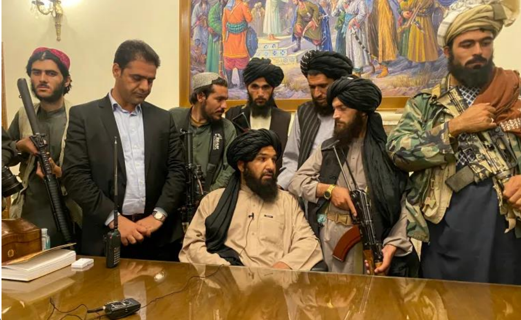
Taliban fighters take control of the Afghan presidential palace after Afghan President Ashraf Ghani fled the country, in Kabul, Afghanistan on August 15, 2021

This marked a new and complex reality that the world is still grappling to grasp: a Taliban-ruled Afghanistan. Initially rooted in the triumph of jihadist ideology, the current situation poses internal and external challenges for the Taliban, Afghanistan, and stakeholders. This report focuses on critical aspects, from the Taliban's governance style and international interactions to public perceptions and the future trajectory of Afghanistan. By addressing knowledge gaps, the analysis aims to provide insights into the dynamics shaping Taliban rule, its impact, and current challenges, and avenues that stem from it.