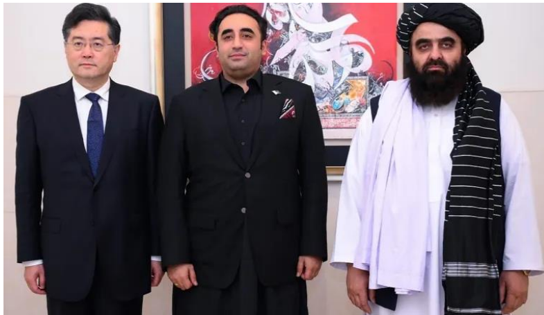
Chinese Foreign Minister Qin Gang (L), Pakistan's Foreign Minister Bilawal Bhutto Zardari (C) and Afghanistan's foreign minister, Amir Khan Muttaqi, pose after a meeting in Islamabad

Malik emphasized that the Taliban's diplomatic efforts, despite lacking formal recognition and enduring a short initial international backlash, have proven successful. Two years later, the international community, formally or informally, is actively engaging with the Taliban regime. Countries seek access to strategic routes and resources, leveraging diplomatic channels to maintain influence, often at the expense of competing interests. Notably, the Taliban has adeptly conducted diplomacy and external outreach, showcasing a shrewd approach to navigating international relations.